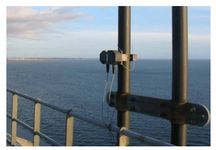
The measuring systems (including accelerometers, filters and transmission) on the vertical suspension cables were installed in special boxes to ensure long-term robustness under harsh weather conditions.

To withstand the harsh weather conditions on the Great Belt strait, the sensors, filters and transmitters were installed in a special fiberglass-reinforced housing (shown in the photograph