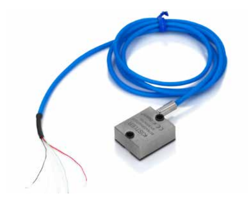
The K-Beam low-frequency accelerometer from Kistler, including special cabling, as installed on the Great Belt Bridge in Denmark.

In the 25 years that have passed since the installation of sensor technology on the Great Belt Bridge, Kistler has equipped bridges all over the world with condition monitoring and Structural Health Monitoring solutions. But the scope of application for this technology is not limited to bridges – it can also help protect buildings and structures of many other types. Typical applications include power plants, wind turbines and historical