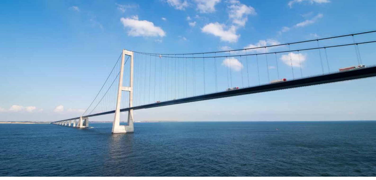
The Great Belt Bridge in Denmark, one of the world's longest suspension bridges, benefits from Structural Health Monitoring and optimization thanks to measurement technology by Kistler.

Sensitive structures such as bridges need continuous monitoring – but how can this be achieved? The right measurement technology can detect structural changes well before infrastructure assets reach critical conditions. On the Great Belt Bridge in Denmark, a system from Kistler has been operating since 1998 to measure the structure's sway in the wind and the natural frequency of its suspension cables – key parameters for assessing the condition of this important fixed link.