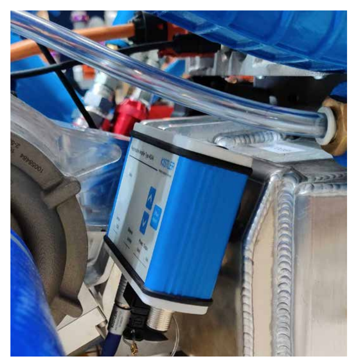
A 4624AK amplifier from Kistler is integrated in the Forze IX motorsports race car from Forze Hydrogen Racing; it transmits signals from different piezoresistive pressure sensors to the hydrogen car's control system.

The Forze IX is the latest hydrogen-powered race car designed and developed by Dutch students based in Delft. In the process, multiple Kistler solutions are used to measure pressure, temperature, torque, and vehicle dynamics. Dual fuel cells, zero emissions, race-winning performance and outstanding safety: assets that make the Forze IX a truly impressive achievement.