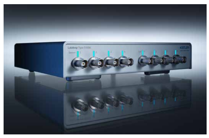
Data acquisition for ground and flight testing for Airbus Zephyr was done using the laboratory charge amplifier LabAmp 5165A from Kistler with his flexible user interface and daisy-chaining capabilities.

Full operational functionality confirmed after extreme cold storage Both solutions are based on an 8793A K-Shear accelerometer from Kistler. The low-temperature version of this triaxial IEPE sensor for shock and vibration measurement can be operated at down to -195°C, making it an ideal solution for flight tests in the extreme cold of the stratosphere. Nevertheless, there was a challenge to overcome, as Sharon Turner, Applications Engineer at Kistler explains: "The Zephyr team wanted to be able to turn off the sensor in flight in order to save battery power. Although the sensor will operate happily down at -196°C the minimum storage temperature we'd ever tested it to was only -75°C we'd never anticipated anyone would want to power back up at -195°C. Also, we had no in-house capability to test below -150°C. So, we carefully worked through the design with our colleagues in the US and concluded that we were confident it should power back up and work perfectly, but we just couldn't prove it. So Airbus went ahead with their cryogenic trials and the unit did indeed work perfectly with no detrimental effect on performance."