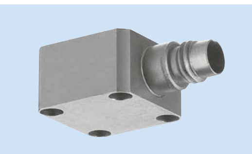
The 8793A K-Shear accelerometer from Kistler is a small and lightweight quartz sensor for shock and vibration measurement – used in the Airbus Zephyr project in its cryogenic version (min. temp. -195^{\circ} C).

However, there is an important non-technical aspect to be taken into account: stratospheric flight is rather new and therefore, regulations are being defined, with some initial principals requiring further elaboration; it requires strategic collaboration and development for effective common operational procedures. That is why Airbus is an executive member of the HAPS Alliance which unites companies from telecommunications, technology, aviation and aerospace in order to promote and democratize HAPS in the stratosphere. Important milestones include regulations, frequencies allocation, common standards and interoperability – and not least raising the global awareness of benefits that HAPS technology can bring to mankind.