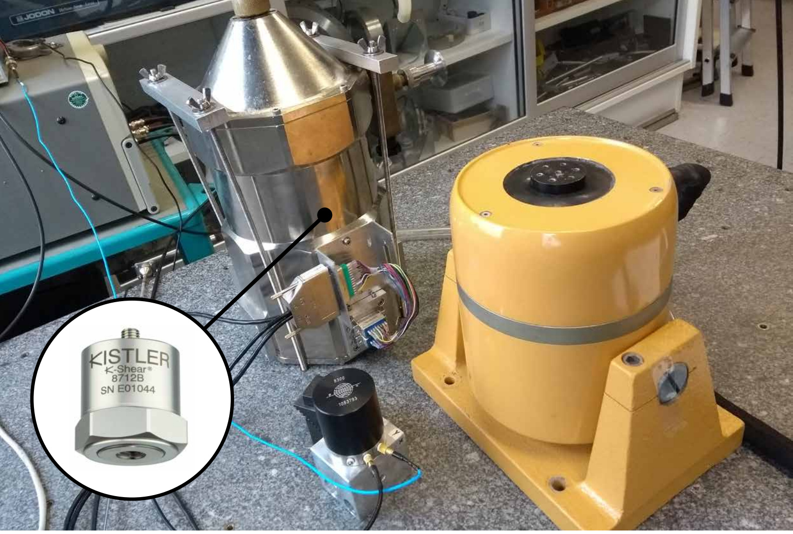
Test setup of the test cryostat, shaker and reference accelerometer from Kistler clamped at an optical table.

SRON is developing a pioneering space telescope for an X-ray observatory planned by ESA (European Space Agency). They tested the highly sensitive accelerometer 8712B5D0CB from Kistler to verify that it is suitable to measure micro-vibrations under cryogenic conditions near absolute zero. The aim was to gain further insights on how micro-vibrations influence the temperature stability of the involved FPA (Focal Plane Assembly). The FPA serves to cool down the space telescope's highly sensitive heat detectors.