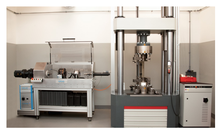
Thanks to its laboratory equipped with the new Analyse system from Kistler (left), REYHER can now carry out even more extensive testing to meet its customers' increased quality requirements.

processes – and end-to-end traceability of the production history is generally required as well.