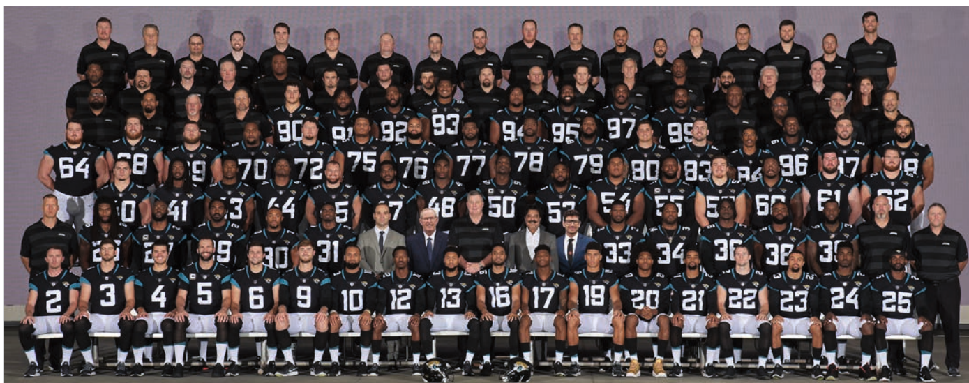
Fit for success: the Jacksonville Jaguars optimize their training with the MARS force plate system from Kistler.