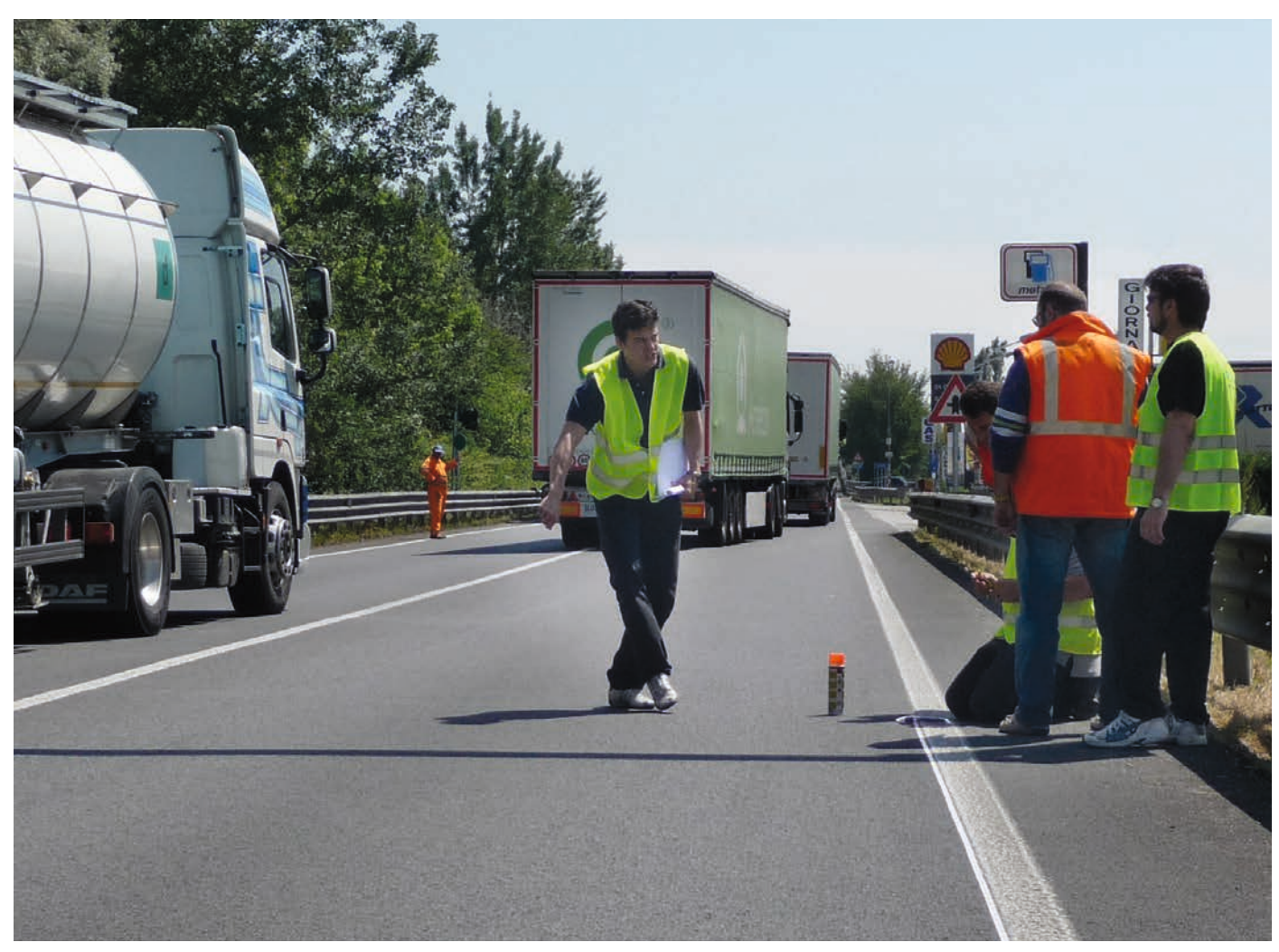
Visual inspection of the road surface.