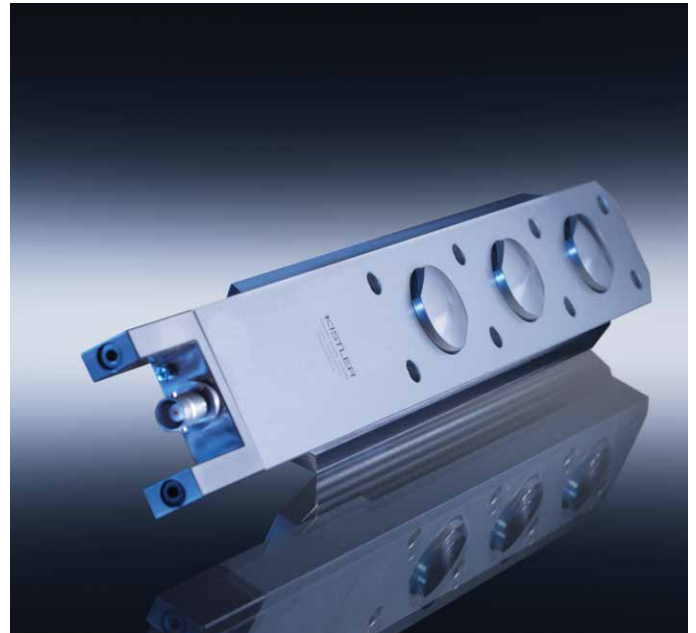
Kistler brake force measuring elements are available for shoe brakes and disk brakes (Type 9305A1B) and disk brakes (Type 9303A2)