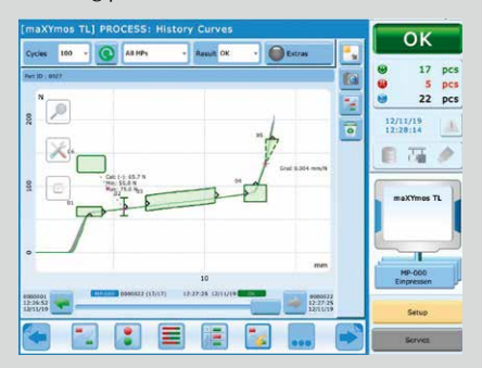
The XY maXYmos monitors oversee and evaluate the quality of a product or production step on the basis of two measured variables in relation to one another

XY monitoring with maXYmos TL (Top Level) and maXYmos BL (Basic Level) for in-process quality monitoring and product testing during joining and mounting processes