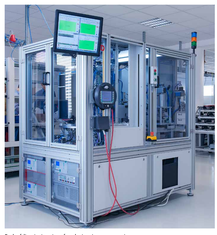
End-of-line test system for electronic components

Typically, multiple functions can be evaluated on an MCD test system, explains Achmed Haddou, Head of Sales at MCD Elektronik GmbH. "The goal is for a test system to be able to perform as many different jobs as possible. This necessitates strict requirements for the sensors so that the greatest possible measurement ranges can be depicted with constant accuracy without requiring the test setup to be fully modified."